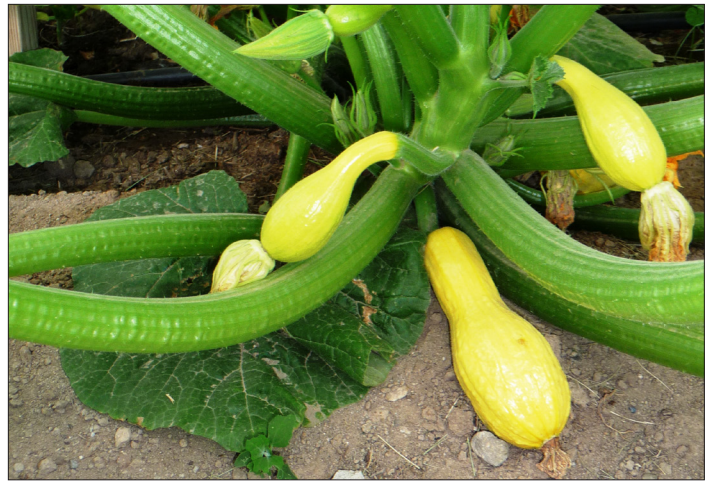
Figure 1. Summer squash, Cucurbita pepo . Type: Yellow Crookneck.

Freezing Winter Squash. Select firm, mature squashes with a hard rind. Wash, cut into cooking-size sections and remove seeds. Cook until soft in boiling water, in steam, in