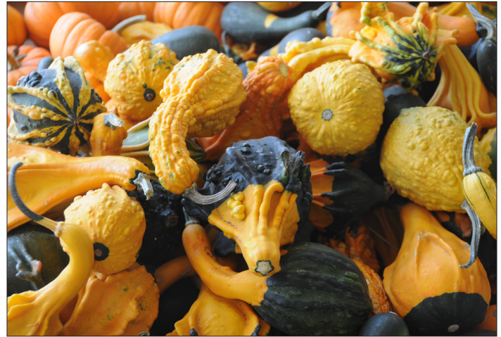
Figure 5. Winter squash, Cucurbita pepo . Type: Autumn Wing Gourd (Decorative).

Issued by Washington State University Extension and the U.S. Department of Agriculture in furtherance of the Acts of May 8 and June 30, 1914. Extension programs and policies are consistent with federal and state laws and regulations on nondiscrimination regarding race, sex, religion, age, color, creed, and national or ethnic origin; physical, mental, or sensory disability; marital status or sexual orientation; and status as a Vietnam-era or disabled veteran. Evidence of noncompliance may be reported through your local WSU Extension office. Trade names have been used to simplify information; no endorsement is intended. Published February 2013.