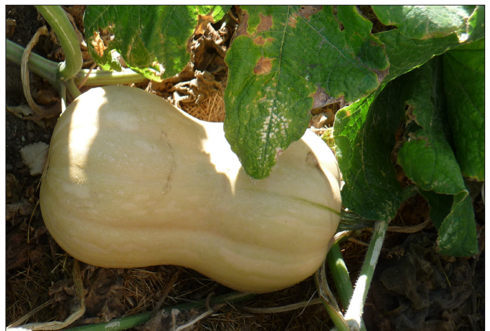
Figure 2. Winter squash, Cucurbita moschata . Type: Butternut.