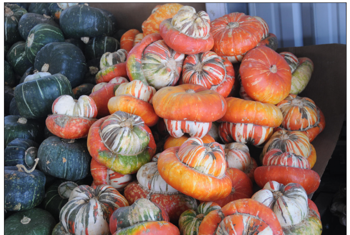
Figure 3. Winter squashes, Cucurbita maxima . Types: Buttercup (left) and Turban Squash (right).

a pressure cooker, or in an oven. Remove pulp from rind and mash. (For spaghetti squash, mashing the cooked pulp is not necessary.) To cool, place pan containing mash in cold water and stir occasionally. Package, leaving 1/2-inch headspace. Seal and freeze.