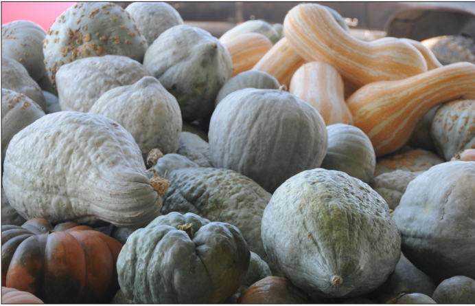
Figure 4. Winter squash, Cucurbita maxima . Type: Hubbard Squash (center). Winter squash, Cucurbita moschata . Type: Striped Curshaw (upper right).

Canning Summer Squash. This is not recommended. It is best to freeze, pickle for canning, or dry summer squash. For more information, see http://www.uga.edu/nchfp/questions/FAQ_canning.html .